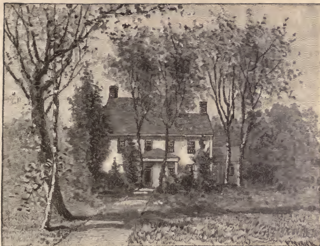
Bayard Taylor's Early Home.